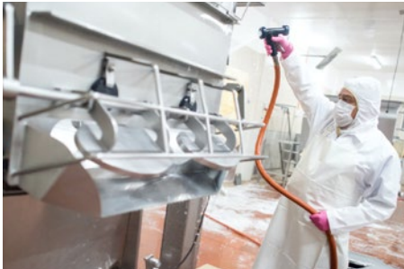
Food & Beverage Processing