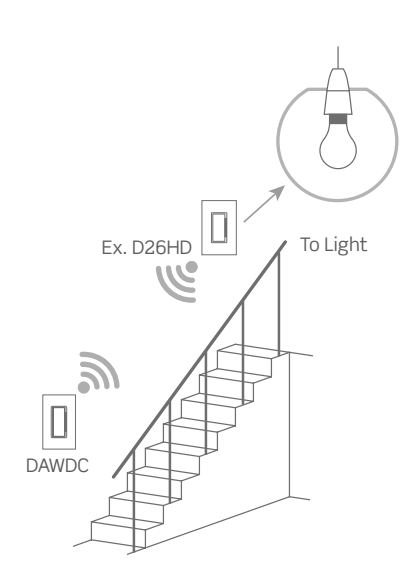
Add additional ON/OFF and DIM/BRIGHT control at the base of a staircase \,