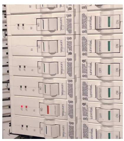
Breaker switch in tripped position clearly notifies of a ground-fault trip

And from an operational standpoint, Prehoda was equally impressed. "The new Leviton Load Center makes it very easy for us and homeowners to detect a tripped breaker and whether it is an arc-fault and ground-fault issue. This is thanks to the new red flags Leviton has installed within each breaker switch to show the tripped position, and the red LED lights on the breaker itself to indicate an arc-fault or ground-fault issue. Older panels were sometimes more difficult to detect since they tripped in the