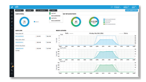
Statistics The Statistics tab provides a visual representation of the network clients and network traffic.

UniFi Mobile App The downloadable app provides free remote cloud access to the UniFi Controller. Analyze and manage the health and traffic of the UniFi network from anywhere in the world.