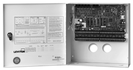
20A00-70 Omni LTe in Enclosure

Surveillance cameras may be added to Omni LTe systems. Activate video recording when an alarm trips, and send an alert to a cell phone or e-mail address. Omni LTe systems have a built-in digital communicator for use with a central station and can dial up to 8 additional phone numbers chosen by the owner for voice notification.