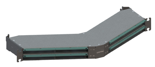
1RU Angled Panel

High-density OPT-X HDX Angled Panels provide an interconnect or cross-connect between backbone horizontal cable and active equipment while minimizing rack space in a frame or cabinet. The 1RU panel allows for pre-terminated solutions and open access to patch cords without the need of any horizontal patch cord cable management. This panel is ideal for deployment above cabinets, within racks, and within cabinets in data centers, equipment rooms, and central offices.