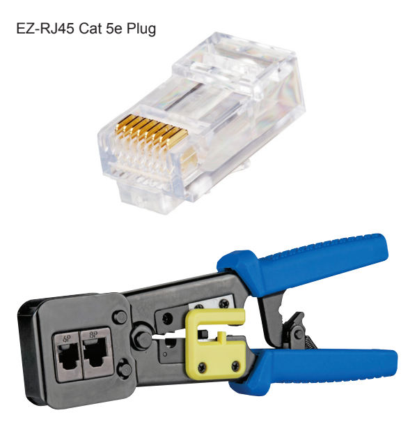
EZ-RJ45 Crimp Tool (not to scale)

Leviton EZ-RJ45 Plug and EZ-RJ45 Crimp Tool support quick, cost-effective UTP wire terminations. The connectors feature openings that allow wires to be inserted and extended out the front to provide increased performance, wire-sequence verification, and no wasted connectors, crimps, or bad terminations. Plugs exceed Category 5e standards when terminated using the Leviton EZ-RJ45 Crimp Tool. The crimp tool features a built-in cutter that crimps and cuts wires in one operation. It accommodates EZ-RJ45 Plugs, and most standard RJ-45 and RJ-11 connectors. This craft-friendly tool features precision ground crimp dies, a full-cycle ratcheting mechanism, and steel construction for strength and durability.