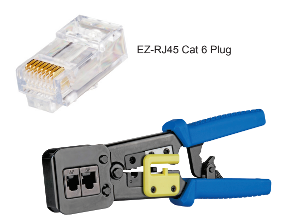
Required Tool: EZ-RJ45 Crimp Tool

The EZ-RJ45 Cat 6 Plug and Crimp Tool provides quick, cost-effective UTP wire terminations. The plug features openings that allow wires to be inserted and extended out of the front, providing increased performance, wire sequence verification, and no wasted connectors, crimps, or bad terminations. The crimp tool features a built-in cutter and stripper that crimps and cuts wires in one operation. It accommodates EZ-RJ45 plugs, and most standard RJ-45 and RJ-11 plugs. This craft-friendly tool features precision ground-crimp dies, a full-cycle ratcheting mechanism, and steel construction for strength and durability.