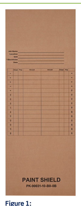
30 Space Paint Shield