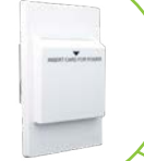
Key Card Switch