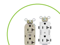
Marked "Controlled" Receptacles