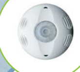
Ceiling Mount Sensor