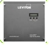
VerifEye Series 8000