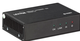
Transmitter — front

Extend HDMI signals up to 70 meters (230 feet) over a single category-rated cable for applications in classrooms, conference rooms, control centers, and public venues where reliable high-definition video is needed. The certified HDBaseT technology supports a complete professional plug-and-play installation that includes HD video, bi-directional, power, bi-directional IR, multi-channel audio, and RS-232 control.