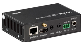
Transmitter — back