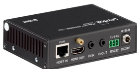
Receiver — back