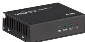
Receiver — front