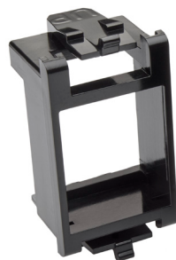
Bezel (not to scale)