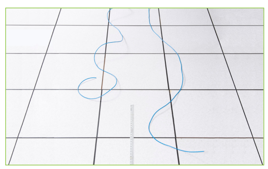
Figure 4: Cable recoil test